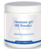
Immuno-gG® SBI Powder 2.6 ounce jar (#5293)